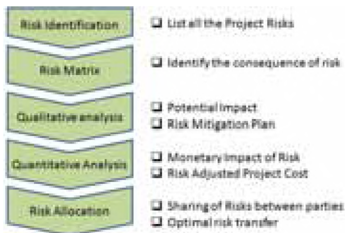
Figure 1 : Risk Management

Assessing and allocating risk to achieve added efficiency is what makes PPP a potentially powerful way of reducing project-related costs and achieving improved value for money for the public sector. The level of risk can be changed by allocating responsibility for individual risks to those who are best able to manage them. This is one of the most important component of defining an PPP project. The diagram below illustrates how Risk planning should be engaged into.